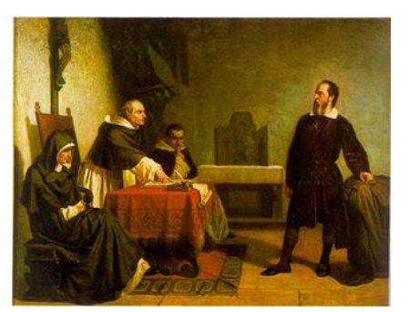
Galileo facing the Roman Inquisition 1857 painting by Cristiano Banti

This contradicted the current Church doctrine that the earth was the center of the universe.